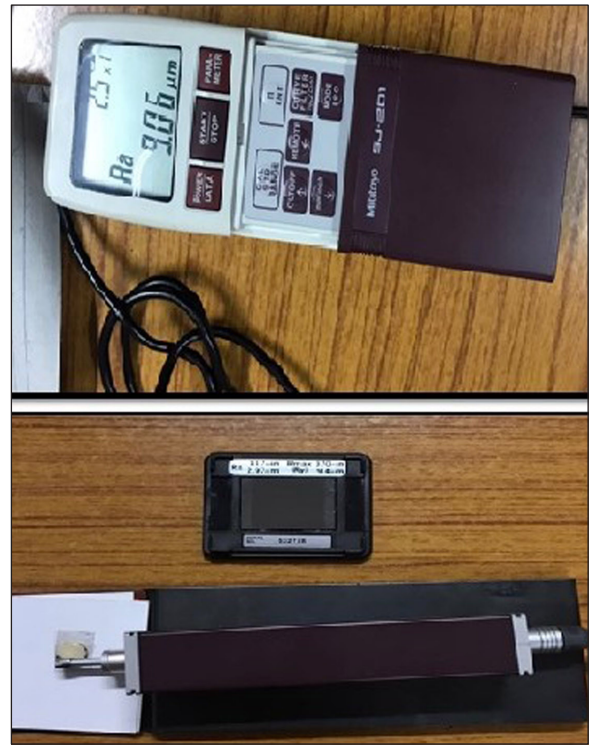
Fig. 5. Surface Profilometer.

The fifth groups of test specimens were subjected to the action of cigarette smoke in a customized smoke chamber using a glass beaker. A rubber stopper was fitted with a hole to support one end of the cigarette and a vacuum system that caused a negative pressure to aspirate the smoke released by the cigarette. For active filling of cigarette smoke in the smoke chamber, the outlet was closed and vacuum system was switched on for 2 seconds (puff duration). To maintain passive exhaust of smoke, rubber stopper was removed for 60 seconds before the next smoke cycle was performed, so as to mimic passive exhalation of smoke in vivo.10 The test specimens were placed at the base of the glass beaker, so that the greater part of their surface would be exposed to cigarette smoke (Figure 4). For each sample, twenty cigarettes (Classic Mild, ITC) were used, and each cigarette was burnt in a standard time of 10 min. Prior to colour change and surface roughness measurements of each specimen, all the specimens were rinsed with distilled water at 37°C and dried with filter paper. The readings were recorded at the end of 30 days.