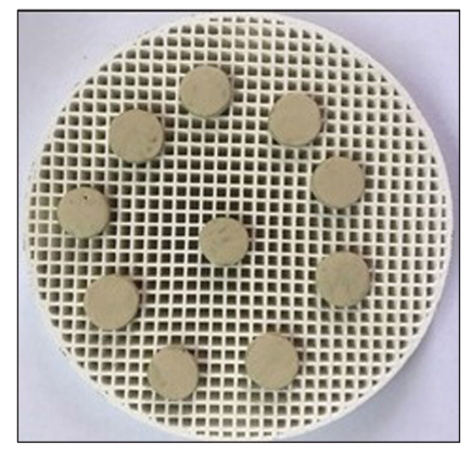
Fig. 2. Fired specimens.

porcelain (Figure 1B). Subsequent to paste opaque application, Vita VMK Master and Ceramco-3 ceramic powder were mixed according to manufacturer instructions and applied to the metal substructures which were condensed in the cylindrical mold with the help of the plunger. After firing, the samples were finished and polished using the necessary tools and measured nine times along their length with a micrometer until the desired thickness was achieved (Figure 2). The samples were ultrasonically cleaned for 5 minutes and then glazed at recommended temperature for 2 minutes.